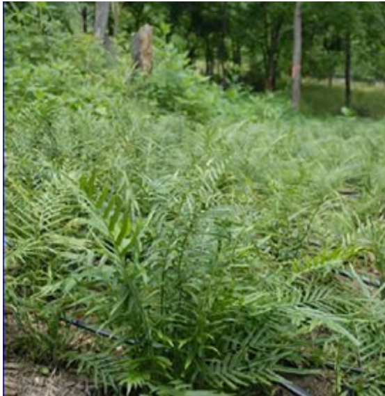
Chinese brake ferns ( Pteris vitattata ) were planted in 2005 and first harvested in November 2007. Harvested material (including arsenic that hyperaccumulated primarily in fern fronds) was disposed offsite as hazardous waste.