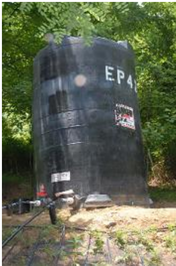
The hilltop gravity irrigation system uses a small filter and network of 1-inch PVC piping equipped with a pressure gauge.