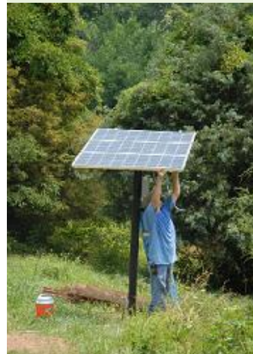
Solar energy to generate electricity for water pumping is captured by a 390-W photovoltaic array consisting of three 12-volt panels.