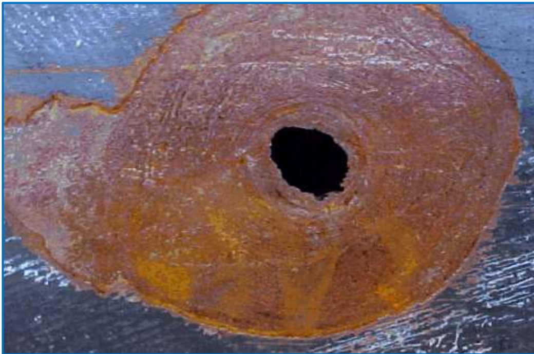
Corrosion Plug Removed by Ethanol