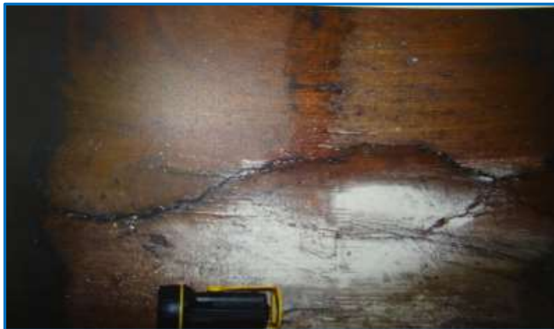
92 Octane UST interior – water entering tank through crack