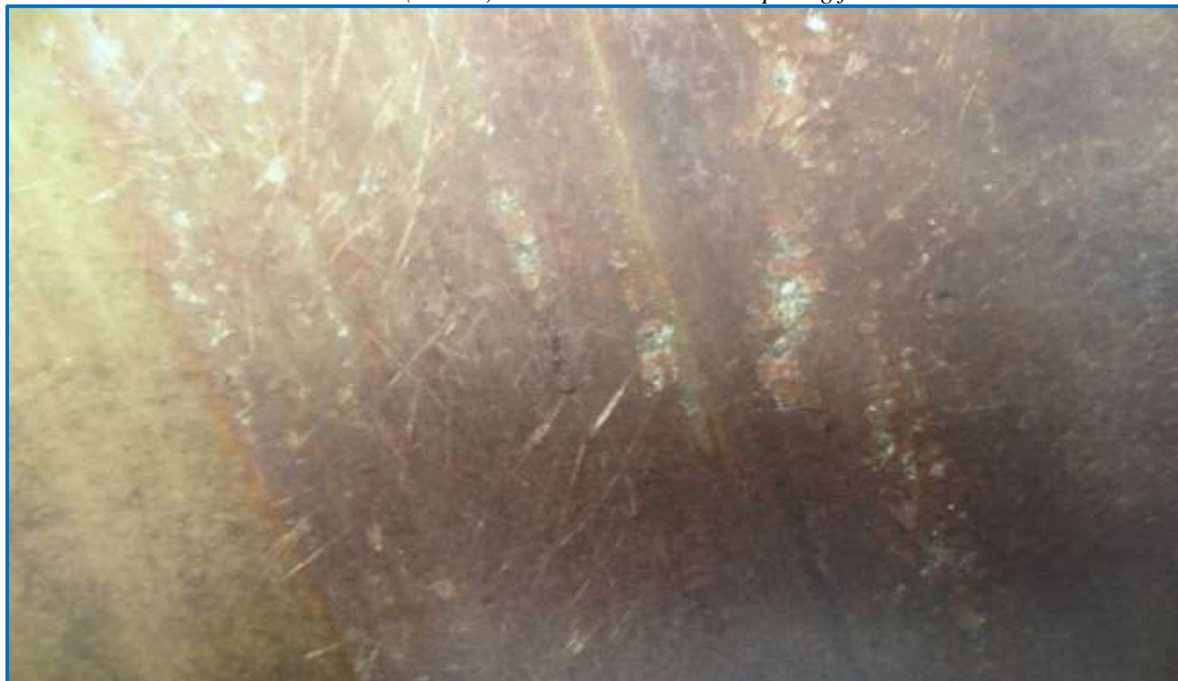
UST 87 Octane (master) - Gel-coat breakdown exposing fibers