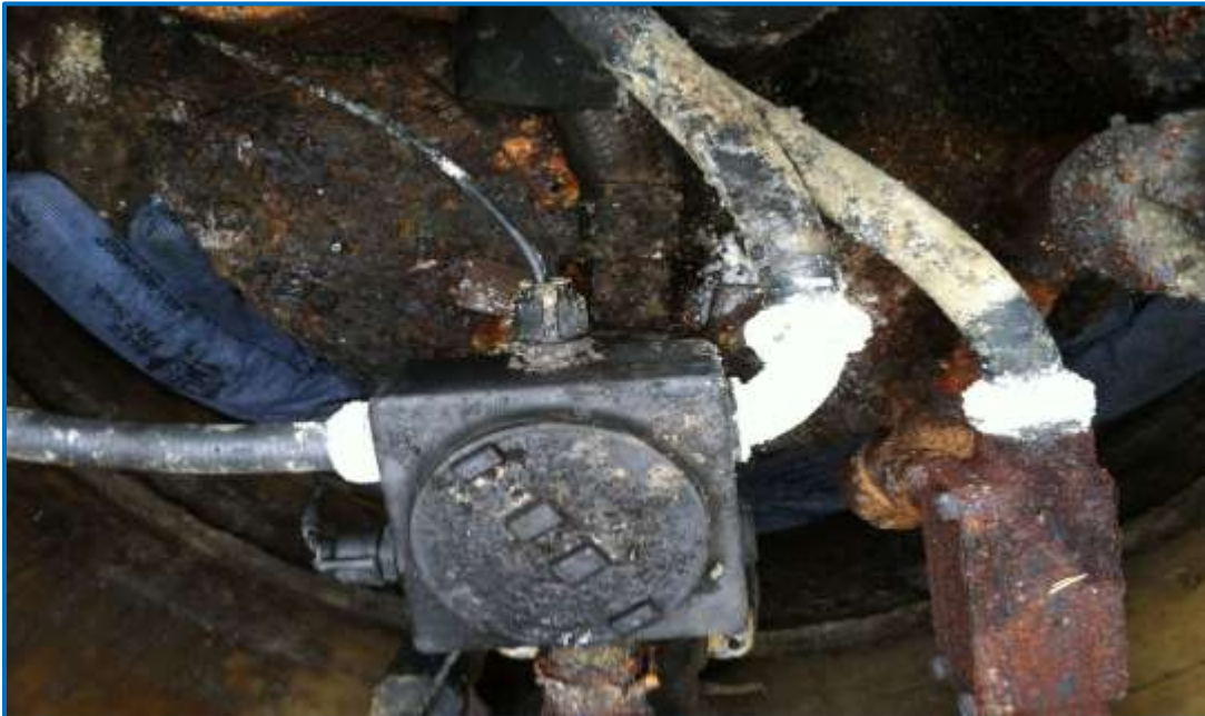
Corrosion on Conduit in STP