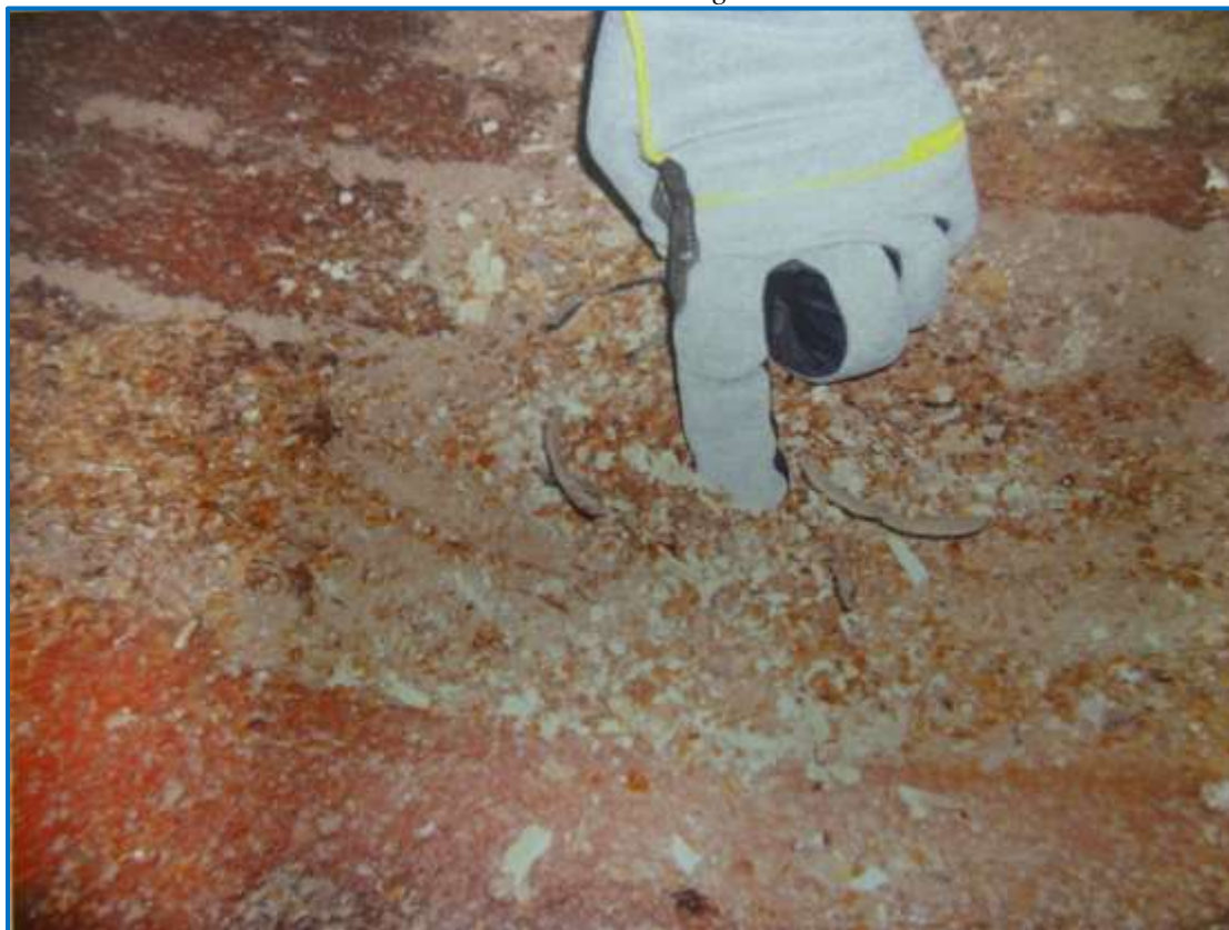
UST 87 Octane internal view: gel deterioration