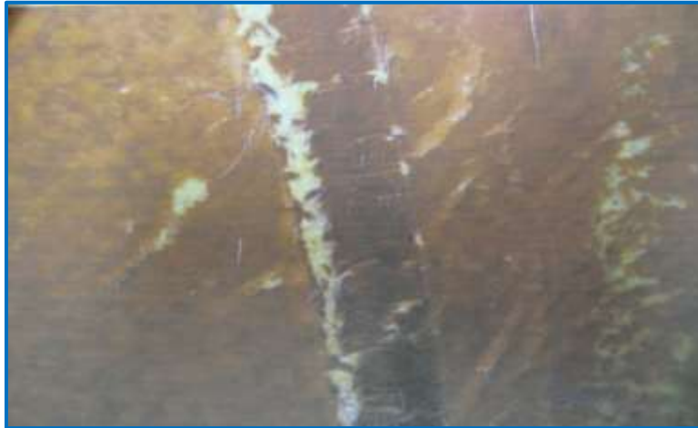
92 Octane UST – breakdown observed during pre-blast inspection