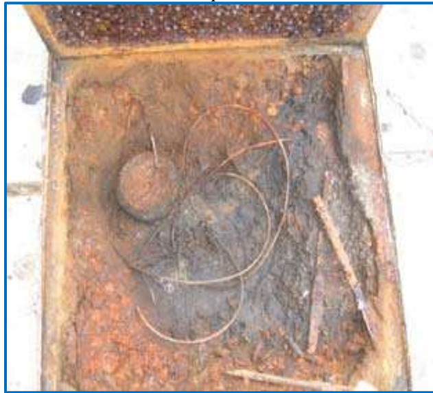
Corroded Incompatible ATG Probe