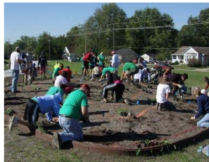
Pollinator Partnership (P2) at Chemical Commodities Inc. Superfund site, Kansas

https://www.epa.gov/superfund-redevelopment-initiative/redevelopment-partnerships