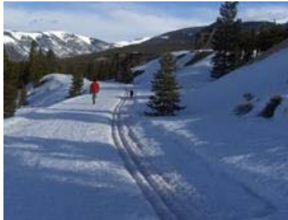
Rails-to-Trails Conservancy support at California Gulch Superfund site, Colorado