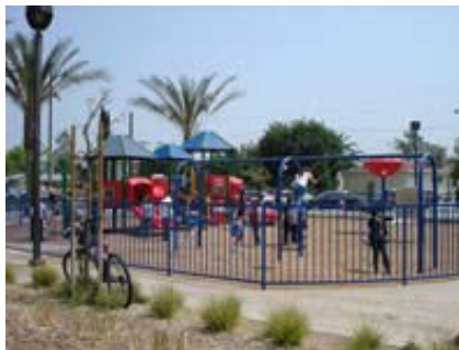
The Trust for Public Land support at Pemaco Maywood Superfund site, California