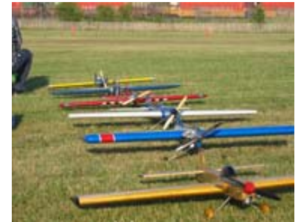
Academy of Model Aeronautics support at Auburn Road Landfill Superfund site, New Hampshire