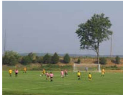
U.S. Soccer Foundation support at Avtex Fibers Superfund site, Virginia