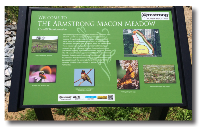
Welcome board highlighting the features of the Armstrong Macon Meadow.

The Armstrong World Industries Superfund site is located in Macon, Georgia.