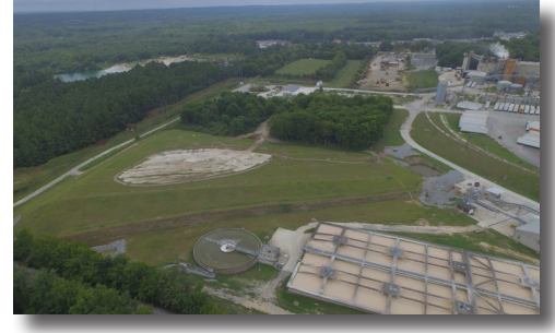
Aerial view of the Armstrong Macon Meadow.

The pollinator meadow and gardens also provide several additional benefits. The meadow is a sustainable, cost-effective alternative to mowing the cap several times a year, thereby reducing carbon emissions. Native vegetation also conserves resources with the use of less water and fertilizer, while effectively preventing erosion of the engineered cap's soil cover.