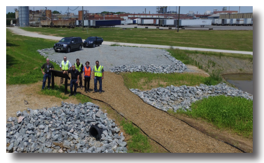
Walking paths throughout the meadow enable visitors to experience each of the four pollinator gardens.