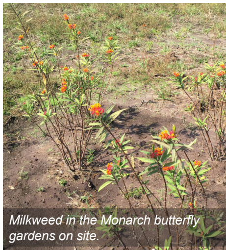
Milkweed in the Monarch butterfly gardens on site.