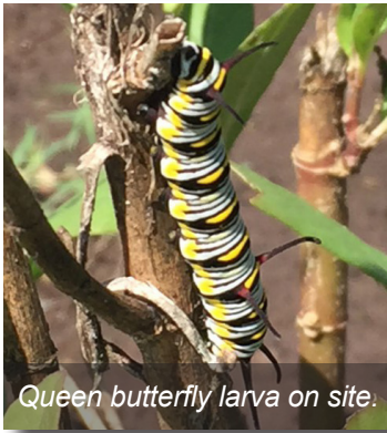
Queen butterfly larva on site.