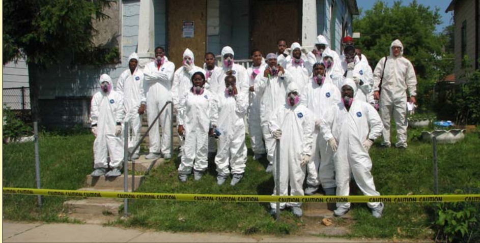
The Milwaukee Community Service Corps Job Training Class on site