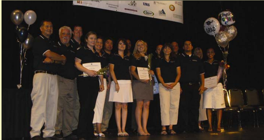
Students Graduating from Tucson, Arizona's, Job Training Program