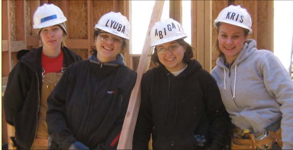
Participants from the Oregon Tradeswomen, Inc., Brownfields Job Training Program