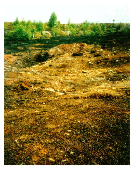
Orzel Bialy smelter waste pile in 1994, before remediation efforts began.

Since the fall of Communism in 1989, new laws and regulations have been enacted to protect and restore the environment. Progress has been made with advances such as the installation of stack emission scrubbers and the construction of wastewater treatment plants. However, intense economic and employment pressures have hindered environmental efforts. Any plan for remediating the waste piles would need to be inexpensive.