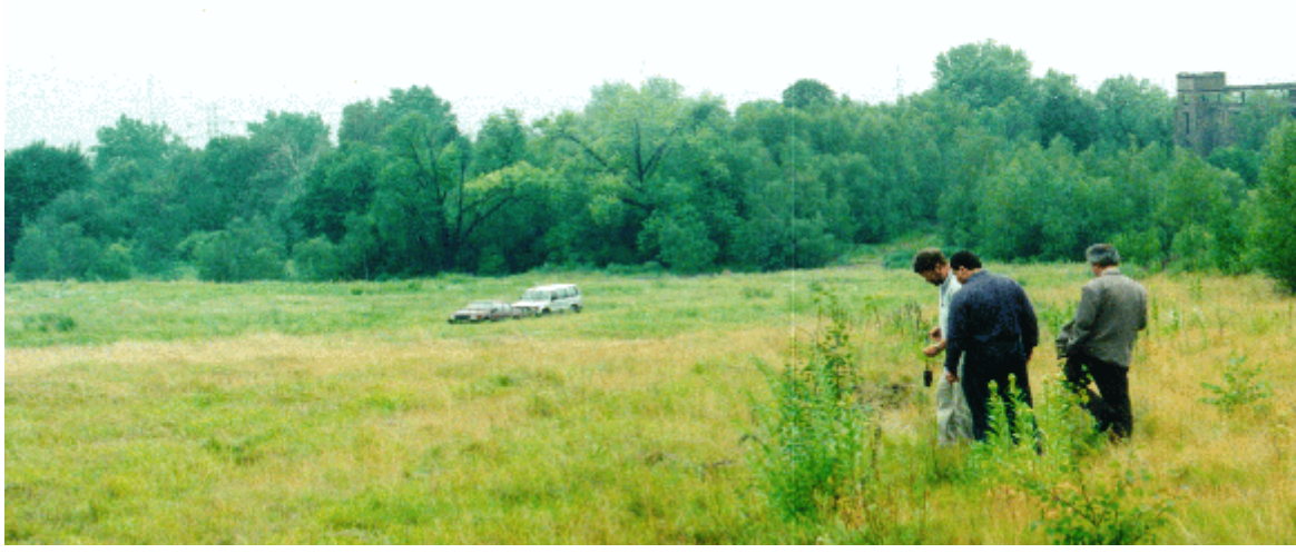
Native woody species can be seen returning to the Orzel Bialy smelter waste site in this 1999 photograph.

Based on the results, the scientists recommend a one time application of lime and biosolids of 75 to 150 Mg/ha and identified a list of the most acid/salt tolerant grass species and cultivars for use in seeding mixtures. The exact amounts of amendments and seeding mixtures should be based on a detailed survey of the chemical properties of the waste at the site. For heavily contaminated sites, such as the Doerschel site, a lime cap with a high percentage of calcium