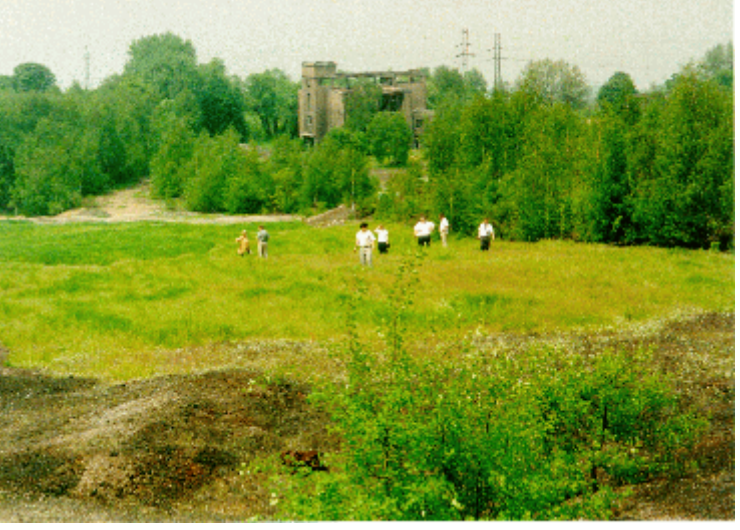
Orzel Bialy smelter waste site in 1996.

Two sites were chosen comprising smelter wastes from a Doerschel furnace and a Welz smelting process. The site covered a total of 2 ha, all of which was barren of vegetation. Before installation of the experiment, it was important to assess the exact chemical and structural nature of the waste piles. Samples from over 160 grid points (from 0 -5 and 20 -