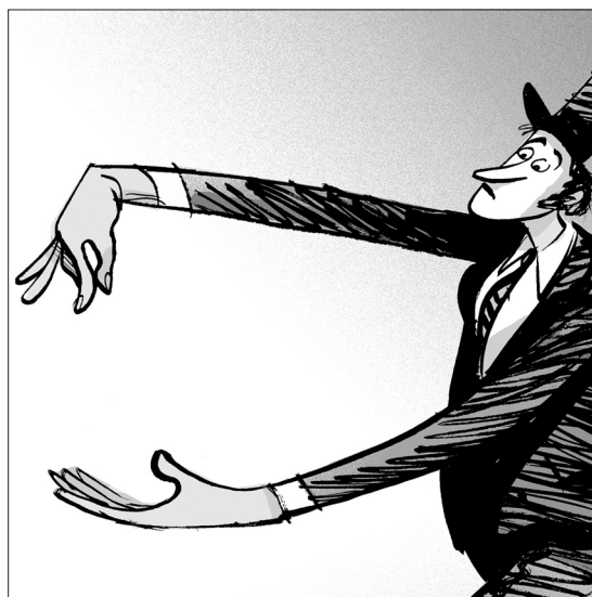
The weaknesses in the current system are evident in almost every relevant statute

particle size as a factor. This potentially emasculates the act with respect to nanomaterials. Most nanomaterials will not be categorized as new chemicals and thus will not be reviewed.