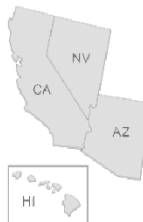
EPA Region 9