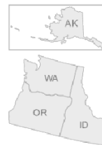
EPA Region 10