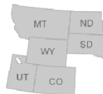
EPA Region 8

Brownfields Revolving Loan Fund Applicants in EPA Regions 8, 9, and 10