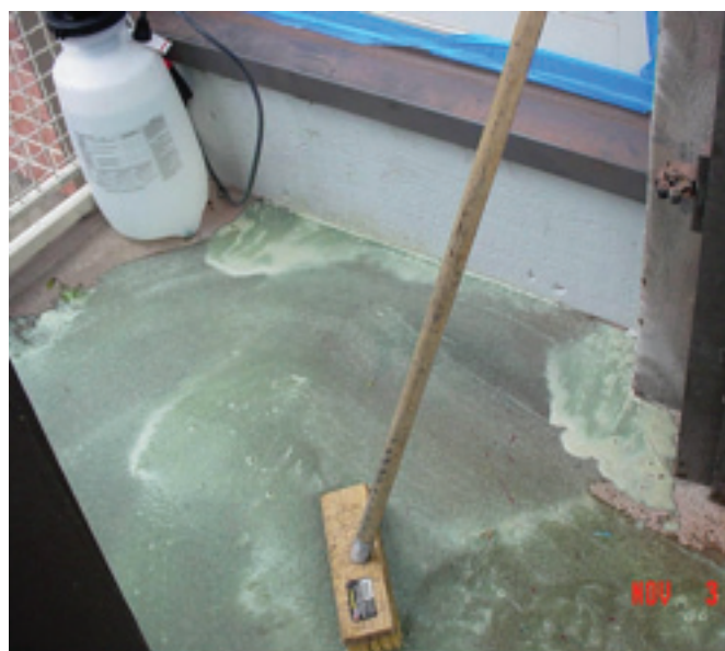
FIGURE 3.3 CAPSUR® application on PCB-Contaminated concrete surface

In presentations by Scadden and Mitchell (2001), cleaning and source encapsulation methods used to remediate PCB-contaminated concrete floors were summarized and their efficacy was examined. Cleaning methods for PCB-contaminated concrete floors included a double-wash-rinse procedure (Title 40 Code of Federal Regulations CFR Section 761.30(p)), which is required to prepare PCB-contaminated concrete for encapsulation. The surface washing steps used for this remediation included a detergent wash (1:3 ratio of water and Z-Green, ZEP Chemical Company), a potable water rinse, a terpene hydrocarbon solvent wash (Big Orange Industrial Degreaser Solvent, ZEP Chemical Company), and a solvent rinse. The detergent washing resulted in a cleaner surface and resulted in generally lower PCB concentrations on the concrete surface, while PCB levels remained the same or slightly higher during the solvent wash and rinse steps. The floors were subsequently scrubbed with a 30% muriatic acid solution