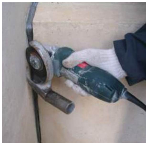
FIGURE 3.2 Removal of Concrete Adjacent to Former Seam of PCB Caulking Laid Between Pre-formed Concrete Panels

This situation is illustrated by a building in which concrete that was adjacent to beads of PCB-containing caulk was found to contain unauthorized PCB levels. Concrete in the immediate vicinity of the caulk was identified as PCB Remediation Waste and designated for removal and disposal. At this building, a ½-inch by ½-inch linear section of concrete was removed from both sides of every seam between concrete panels that formed the façade of the 17-story structure. The concrete sections were removed with hand-held circular grinding tools operated by trained laborers (see Figure 3.2). Approximately 18 miles of ¼ square inch concrete sections were removed from the face of the building. A hand-held HEPA vacuum was used to capture dust generated by the cutting tools. Personal protective equipment including