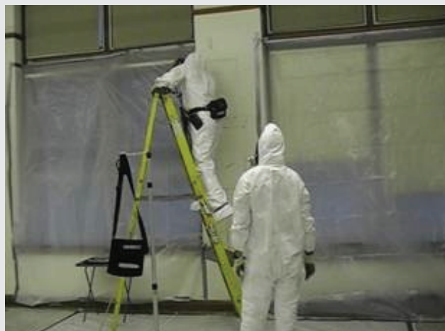
FIGURE 3.1 Photograph of PCB-Containing Caulk Removal Using Hand Tools

Direct bulk removal for PCB-containing paint can include the complete removal of all wallboard that has been painted. For cases where the paint cannot be removed without damaging the structural stability of the external wall, a “false wall” can be constructed over these painted external walls to prevent any direct contact with the existing