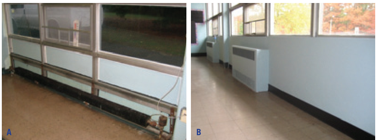
FIGURE 3.4 Panel A – Photograph of Pre-installment of Mini-walls/Panel B – Photograph of Post-installment of Mini-walls

An example of a false wall or “mini-wall” is depicted in Figure 3.4. At the time this building was constructed, PCB caulk was used to seal the joint between the aluminum framing and composite