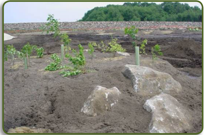
Island Plant Plugs

More than 14,000 low and high marsh wetland plant plugs were planted, as well as shrubs and trees in the upland areas. Species such as seashore saltgrass ( Distichlis spicata ), saltmeadow rush ( Juncus gerardi ), saltmarsh cordgrass ( Spartina alterniflora ), and salt hay ( Spartina patens ) were planted in the salt water marsh. The freshwater wetland was planted with a variety of species, including spatterdock ( Nuphar advena ), water smartweed ( polygonum