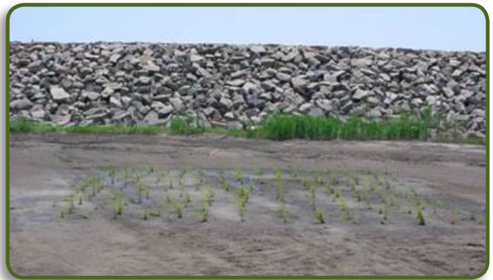
High Marsh Plantings