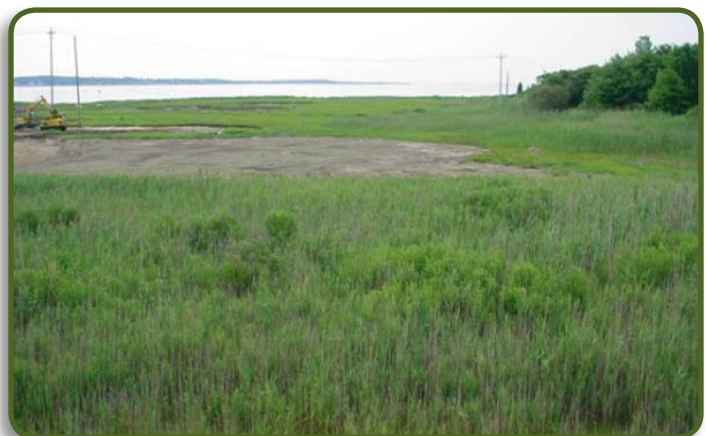
Atlas Tack Revitalization