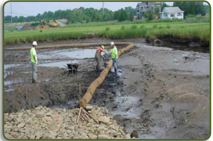
Earthen Berm Installation

The remediation plan was designed to restore the existing marsh and create additional marsh areas as well as provide a means to eliminate storm water flooding. The revitalization included construction of a clay core earthen berm in the wetland north of an existing dike to create separate fresh and salt water wetlands. EPA, USACE, and NOAA jointly designed the new wetlands