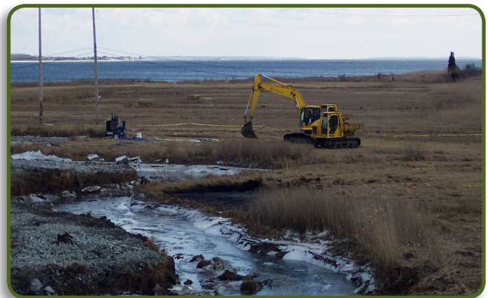
Salt Marsh Excavation