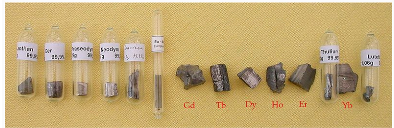
Wikipedia photo = Assortment of lanthanoide group elements. Uploaded at 22:12,19 April 2006 by User:Tomihhndorf . Author User:Tomihahndorf . Permission=GFDL.