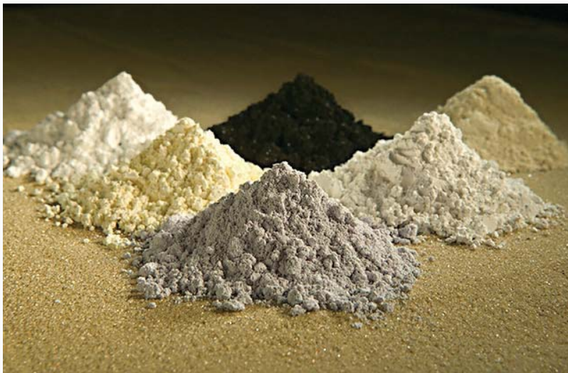
Powders of six rare earth elements oxides.