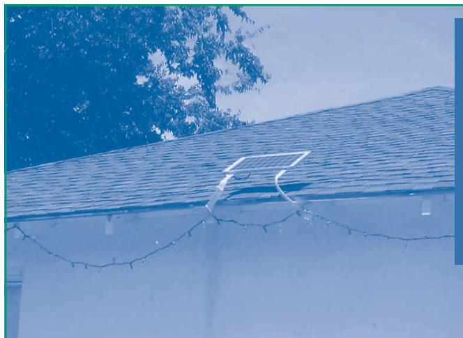
Figure 2. Each photovoltaic panel for the Delfasco Forge offsite VI mitigation project was installed at a 25-50° tilt with unobstructed southern exposure to the sun.

Contributed by Greg Fife, EPA Region 6 ( fife.greg@epa.gov or 214-665-6773)