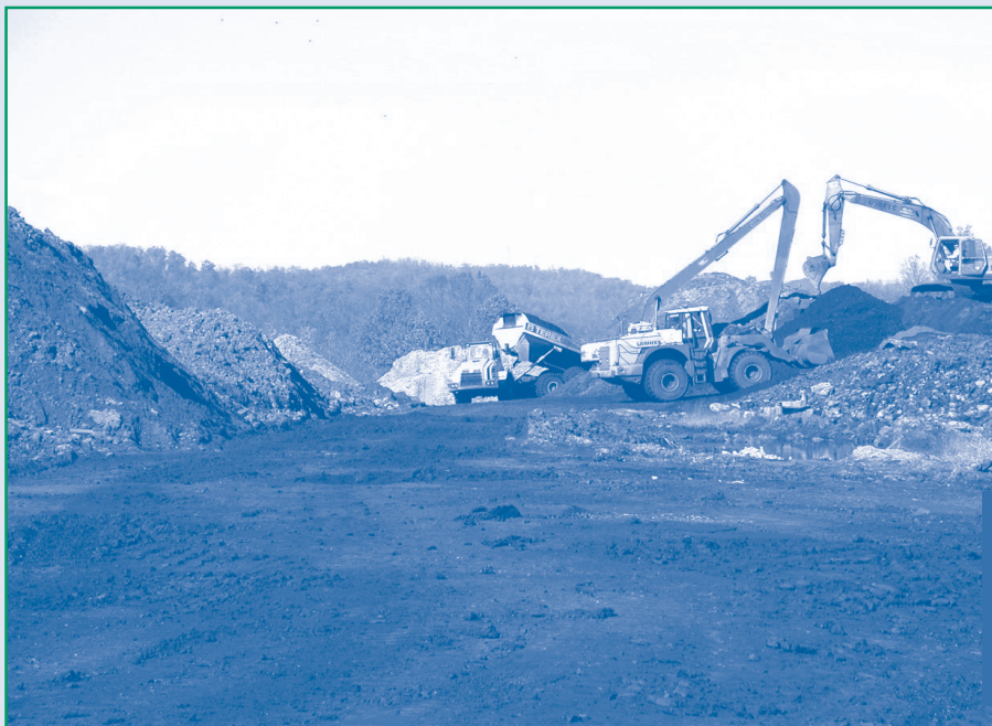
Figure 3. Backhoes segregate excavated wastes as it is screened and crushed at the Sharon Steel Corporation-Fairmont Coke Works Superfund site.