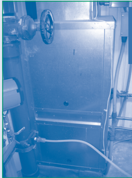
Figure 1. To minimize heat loss and gain other operating efficiencies, the heat pump is joined directly to the HVAC manifold for conditioning air inside the LAI treatment plant.

After passing through the heat exchanger, water is pumped to an air stripping system operating with an air/water ratio of 65/1 to separate VOCs from the water. The system is equipped with two 3,000-pound activated carbon filtration vessels to treat the air prior to its emission from the plant. Water then flows from the air stripper