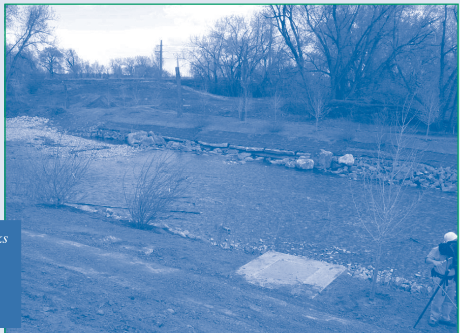
Figure 4. Restoration of river banks along the Poudre River was designed to accommodate heavy recreational use while providing ecological benefits.

Contributed by Paul Peronard, EPA Region 8 ( peronard.paul@epa.gov or 303-312-6808)