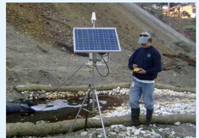
Water monitoring at the New Idria Mercury Mine Superfund site in California involves use of time-interval sampling devices powered by solar energy. Collected sampling data are transmitted via satellite to a website accessible by project staff. This approach supplies a renewable source of onsite energy and reduces the frequency of staff visits to this remote site. Ongoing investigation of this site led to removal actions in 2011 and 2015.

The ASTM Standard Guide for Greener Cleanups outlines a process for identifying, screening and selecting BMPs to minimize the environmental footprint of site-specific cleanup activities. 2