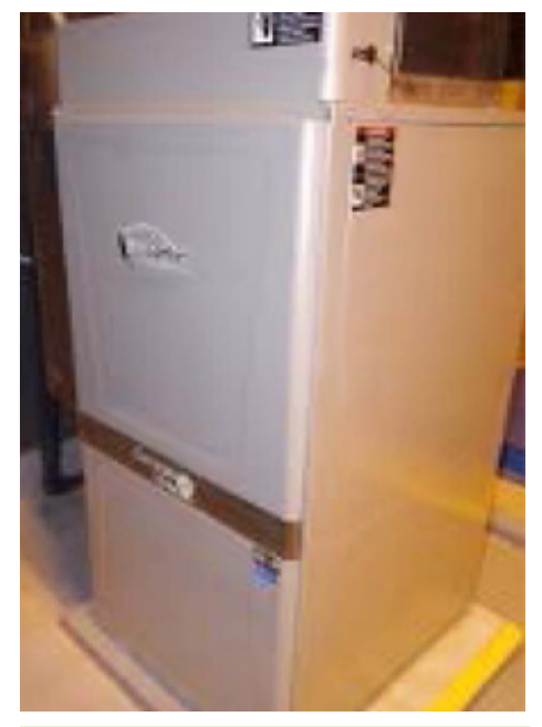
Heat Exchanger: Heat from groundwater entering each exchange unit is transferred to the air by way of metal coils inside the unit.