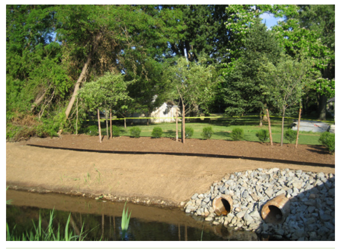
Adjacent Surface Water: Treated water from the offsite plant discharges into the adjacent "Mill Creek," which flows to the Long Island Sound. The creek bank was stabilized by seeding deep-rooted wetland species, covering the seeded areas with jute mat that provides an anchor, and emplacing a layer of erosion-resistant rock around stormwater control culverts.