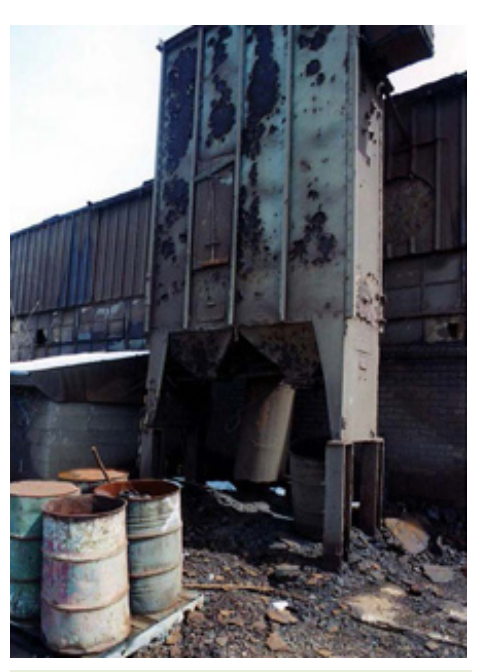
Removal Actions: Cleanup between 1980 and 2005 involved removing more than 1,300 leaking drums and containers used to store trichloroethylene and tetrachloroethylene as well as acids, waste sludges and hydraulic oils.