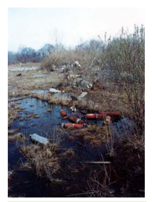
Prior to Cleanup: Contaminated groundwater migrated downgradient from the LAI site through primarily residential areas, toward the Port Jefferson Harbor of the Long Island Sound.

Port Jefferson, New York (PDF) (14 pp, 268.67K)