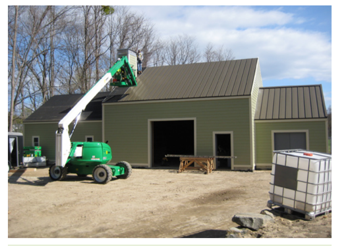
Building Envelope: The offsite treatment building's exterior "envelope" relies on energy-efficient roofing and siding material with potential to meet LEED certification regarding heat island effects (SS Credit 7.2) and regionally obtained materials (MR Credits 5.1 and 5.2).

Integrated Units: To minimize heat loss and gain other operating efficiencies, each heat pump is joined directly to an HVAC manifold for conditioning air inside the treatment plant.