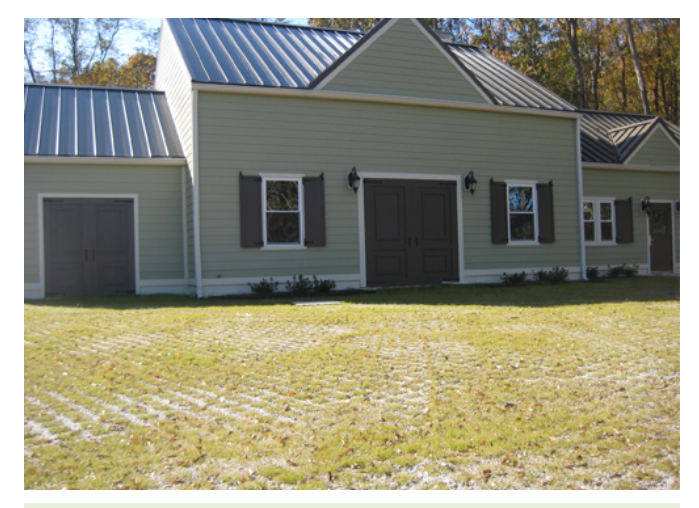
Pervious Pavement: During design of the offsite treatment plant, the Port Jefferson Beautification Committee worked with EPA Region 2 to develop landscape plans that included a "living driveway" of pervious pavement. The paving product is manufactured from materials sourced approximately 25 miles from the LAI site.