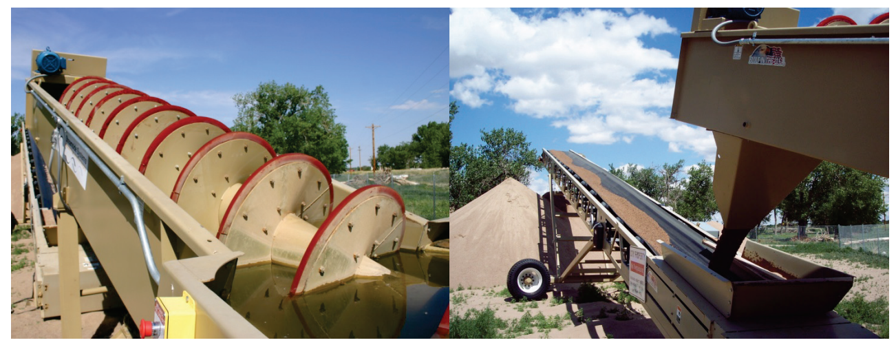
Figure 3. Archimedes screw separator (left) and stacker (right).