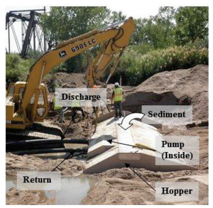
Figure 5. Installation of 30 ft long collector.

The primary component of the collector is a steel hopper (Figures 2 and 5) placed on the bottom along a sediment transport pathway. A manifold system inside the hopper focuses flow across a small region within the hopper, providing high velocities needed to entrain sediment. A dredge pump housed in the hull with the hopper pumps water and sediment through the manifold to the placement area. The pump can also be mounted remotely on land, the preferred configuration for maintenance. Booster pumps can be added to increase the pumping distance, as required.