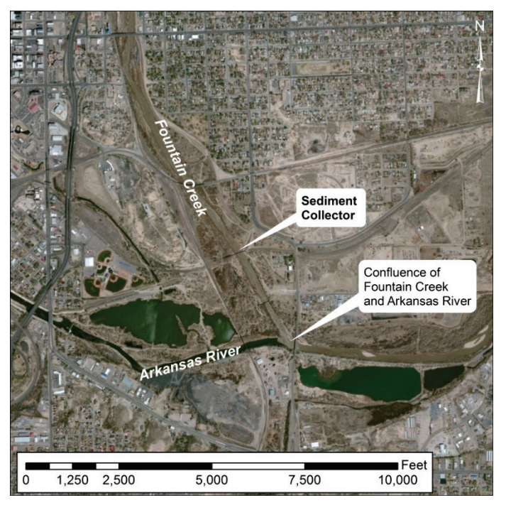
Figure 1. Location of sediment collector.

INTRODUCTION: The first of two technologies being evaluated under this RT is a sediment collector currently installed in Fountain Creek, Pueblo, CO, (location shown in Figure 1) intended to demonstrate technology to alleviate the need for dredging by lowering the downstream grade to reduce flooding ultimately reduce sediment and deposition as far downstream as John Martin Reservoir, a U.S. Army Corps of Engineers (USACE)-managed lake. The system operates on the principle that sediment in bedload can be trapped by gravity and removed at the natural rate of transport, instead of episodically. This DOER TN describes the technology and installation at Fountain Creek, other possible applications, lessons learned, cost. and provides some general guidance for applying collector technology at other sites.