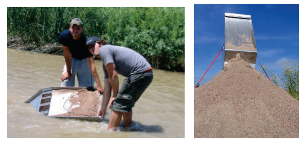
Figure 6. 2 ft collector and drop box used to estimate production rates.

Production rate was the key performance parameter measured. Prior to installation of the 30 ft bedload collector, a 2 ft bedload collector (Figure 6) was temporarily installed in Fountain Creek to estimate bedload transport extraction rates and assess optimal elevation for collector operation. The 2 ft collector pumped sediment into a drop box (Figure 6) that, in turn, allowed a 3 ft<sup>3</sup> container to be filled with the subsequent fill time noted to calculate a production rate. Sediment was collected over a 3-day duration with extraction rates at respective stream flows listed in Table 2. Assuming a linear extraction rate function for a longer collector, respective production rates were estimated for a 30 ft long collector and listed in Table 2 as well.