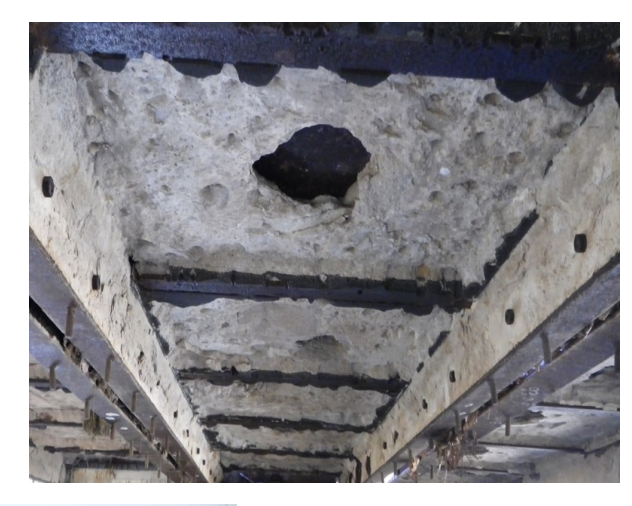
Underside of Mercury Cell Plate Bridge