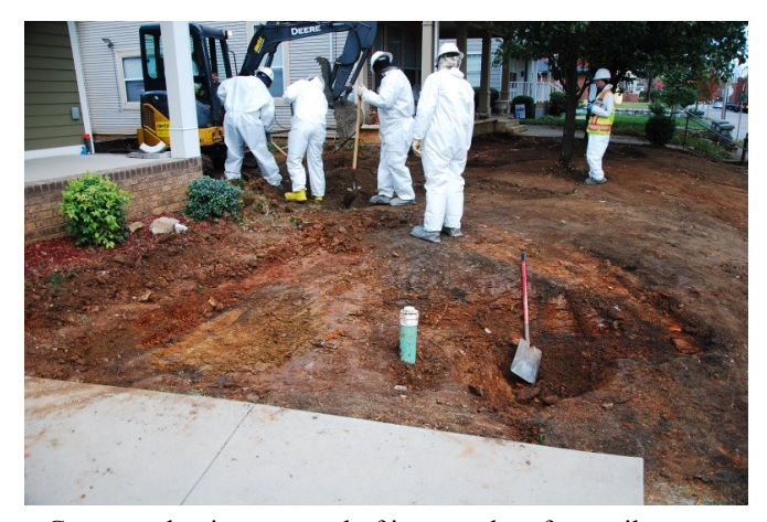
Crew conducting removal of impacted surface soil

The actual source of lead has not been determined, but is suspected to be associated with historic foundry operations. Presently, DoR and EPA are in the process of determining if additional assessment of surrounding areas is warranted.