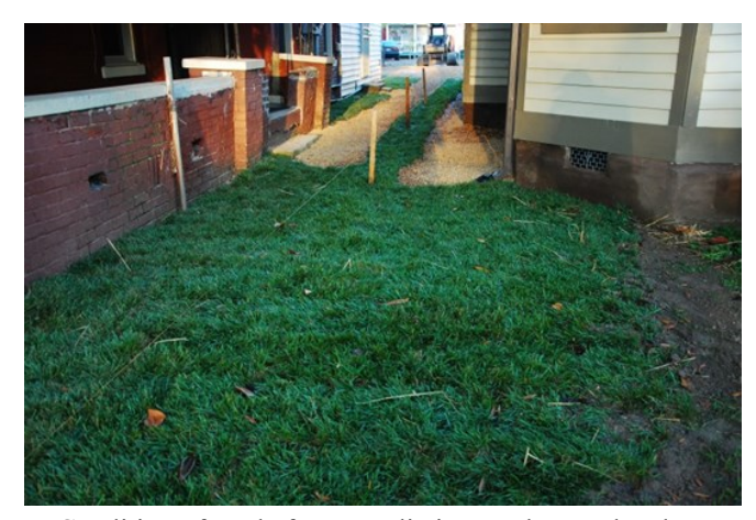
Condition of yard after remediation work completed