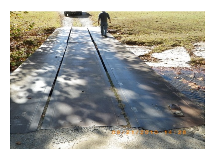
Mercury Cell Plate Bridge

TDEC staff partnered with Wayne County Highway Department staff to canvas the entirety of Wayne County. Later, other locations in Hickman and Lewis Counties were also discovered. To date, 94 locations have been identified with suspect mercury containing material, either bridges or bridge panels. Glenn Springs Holdings (GSH) agreed to implement interim measures (foam application) and to replace bridges where mercury was identified. A total of 82 bridges/panels have been treated with foam and 33 bridges have been replaced. GSH anticipates 15 to 20 bridge replacements per year. TDEC and GSH will continue to identify former bridge locations and address them as necessary. TDEC will also evaluate surface water sampling data and develop a sampling plan for current/former County Highway Department storage yards.