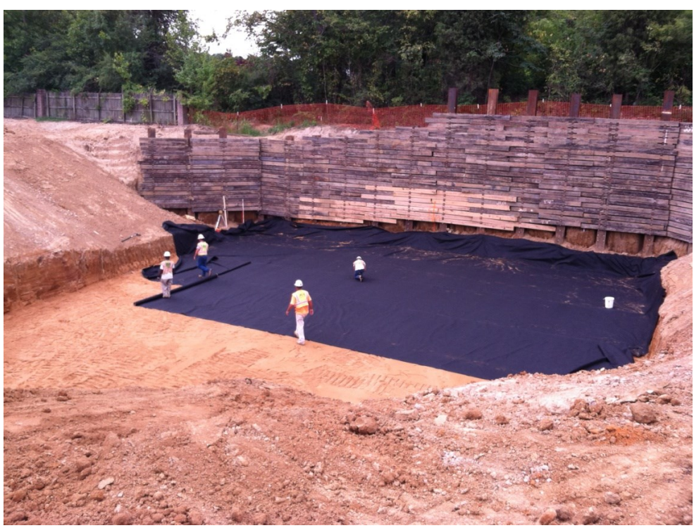
Western pond area (post-excavation) being prepared for soil flushing gallery

Water will be extracted by onsite recovery wells and will be treated by chemical reduction, precipitation and ion exchange treatment modules. The treated water will then be re-injected into the former source area, via the infiltration gallery. It is anticipated that the system will operate for one year with the goal for completion of the remedy by July 31, 2015.